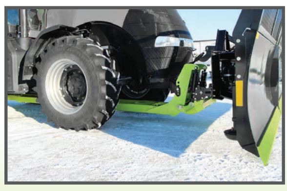
- FM-350 with SV Plow -

Enjoy the convenience, comfort and improved performance of a front mounted snow blower. No matter how much snow you need to move you will appreciate the FM-350. The FM-350 gives you the ability to mount your 3pt snow blower or SV Plow on the front of your tractor instead of on the tractor's rear 3pt hitch. The FM-350 offers you better visibility and ergonomics when coupled with a Schulte Snow Blower. Blowing snow while driving forward, is more efficient than blowing snow in reverse. The FM-350 allows you an increased selection of travel speeds, as your tractor has many more forward gears then reverse gears. This increased gearing selection will result in better snow blowing performance and less wear and tear on the tractor clutch, and your neck.