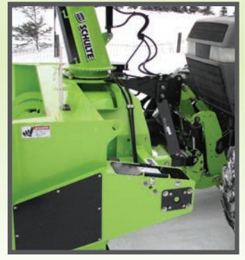
- Draw Bar Mount & PTO Power -

Weight 1650 lbs (748kg) with drive train 1250lbs (567kg) without drive train