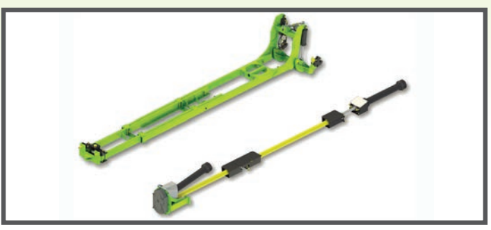
- Rear Hitch or Optional Drivetrain -

Simple attachment and removal from your tractor. A wide selection of proven tractor mounting brackets are available, for new, or older tractor models. A compact Category 2, 3PT lift mechanism ensures